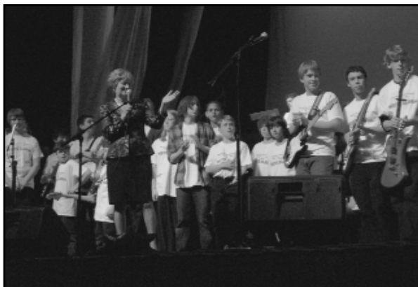
Students and faculty performing in the White Album concert last May

On April 10th, 1970, The Beatles parted company forever, four grown men severing the bonds they had formed in their early teens. In the midst of so much turmoil, they couldn't see what was in plain hindsight. The Beatles were truly greater than the sum of their parts, and when they disbanded to pursue separate careers they left their best work behind them. They also left behind millions of people who loved their music so deeply that nothing would ever take its place. They understood this well enough, and wrote their own epitaph: "And, in the end, the love you take is equal to the love you make."